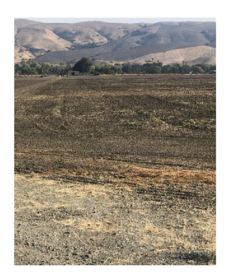
Stadium – Gilroy Christmas Tree Park