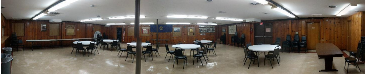
Legion Main Floor Meeting Room (could be used for meals – registration – overflow for Meet & Greet)