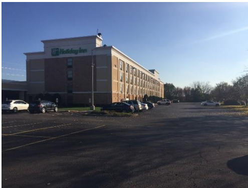
Holiday Inn Gurnee – Front and west side