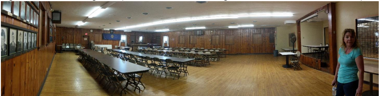
Legion Second Floor Meeting Room (no handicap accessibility)