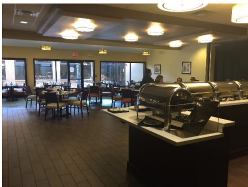
Hotel Breakfast area